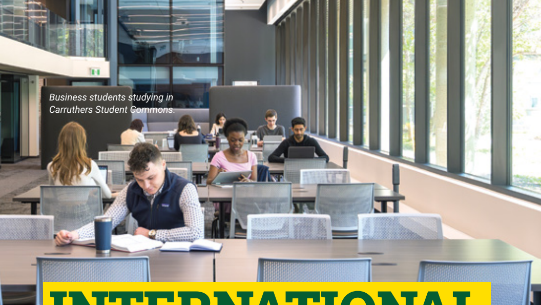
Business students studying in Carruthers Student Commons.