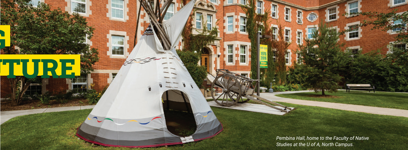
Pembina Hall, home to the Faculty of Native Studies at the U of A, North Campus.

Appointments can be made by contacting indigenous@ualberta.ca