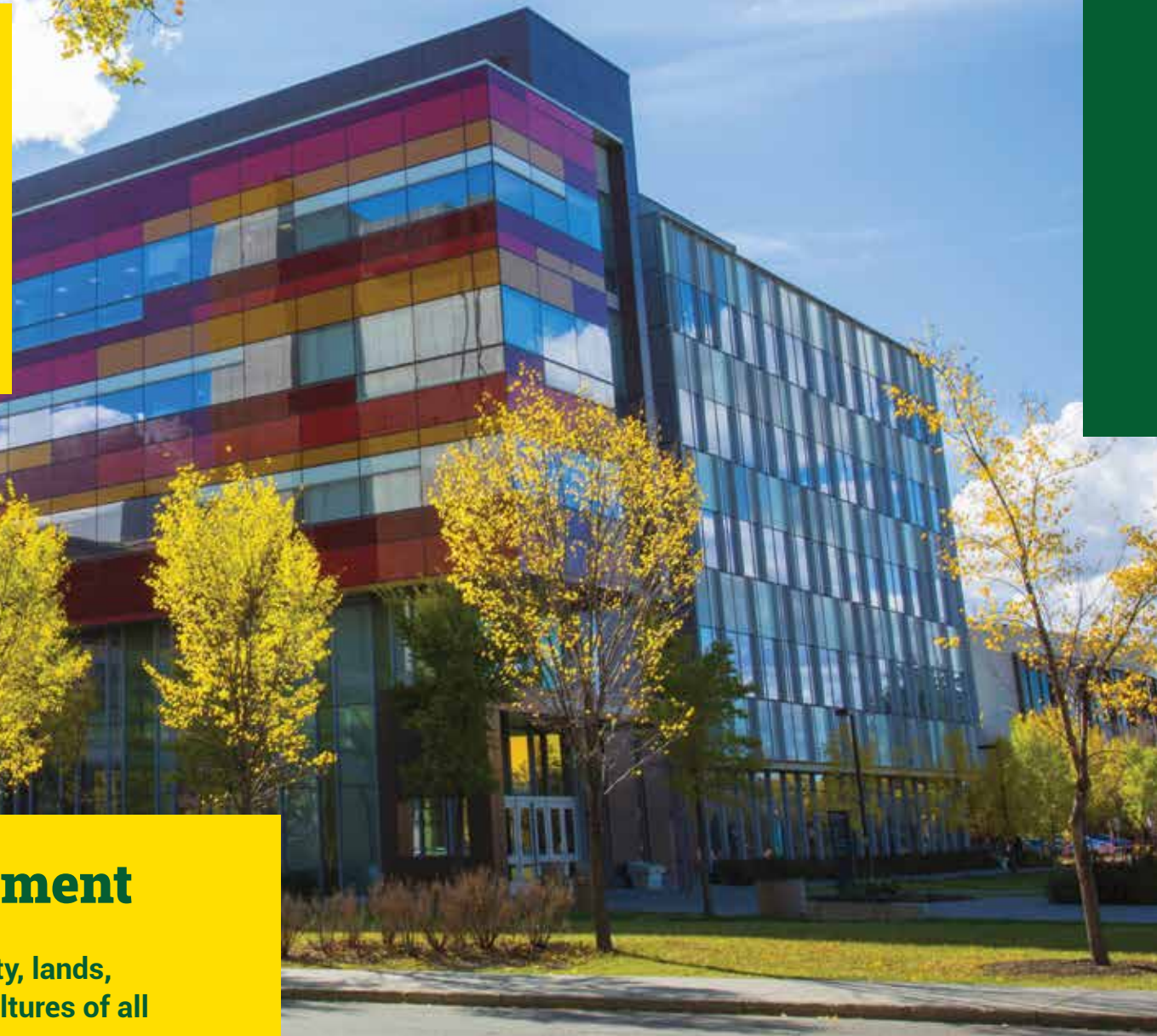
The Edmonton Clinic Health Academy (ECHA), a 150,000 square meter building, is designed specifically to teach team-based and patient-centered care. It houses many of the U of A's health science disciplines, including a dedicated Health Sciences Library.

The University of Alberta, its buildings, labs and research stations are primarily located on the territory of the Nêhiyaw (Cree), Niitsitapi (Blackfoot), Métis, Nakoda (Stoney), Dene, Haudenosaunee (Iroquois) and Anishinaabe (Ojibway/Saulteaux), lands that are now known as part of Treaties 6, 7 and 8 and homeland of the Métis.