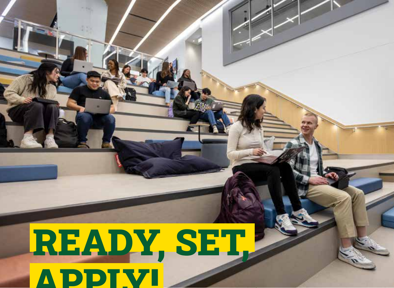
U of A students in a favourite study spot in the Sperber Health Sciences Library in ECHA.