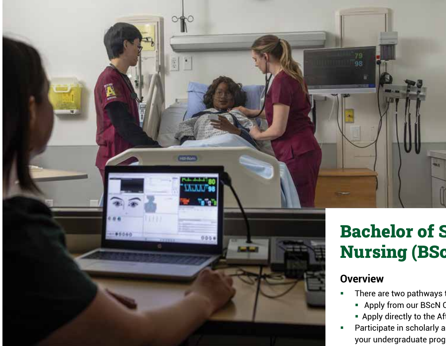
Nursing students in the High Fidelity Simulation Suite in ECHA where they learn to care for a variety of simulated human patients that are being controlled by an instructor.

2023 BScN After Degree grad from Edmonton, AB