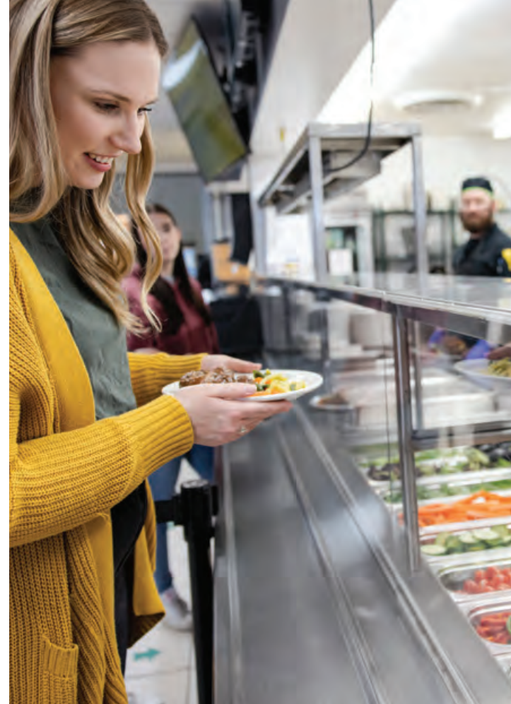
Augustana Dining Hall.