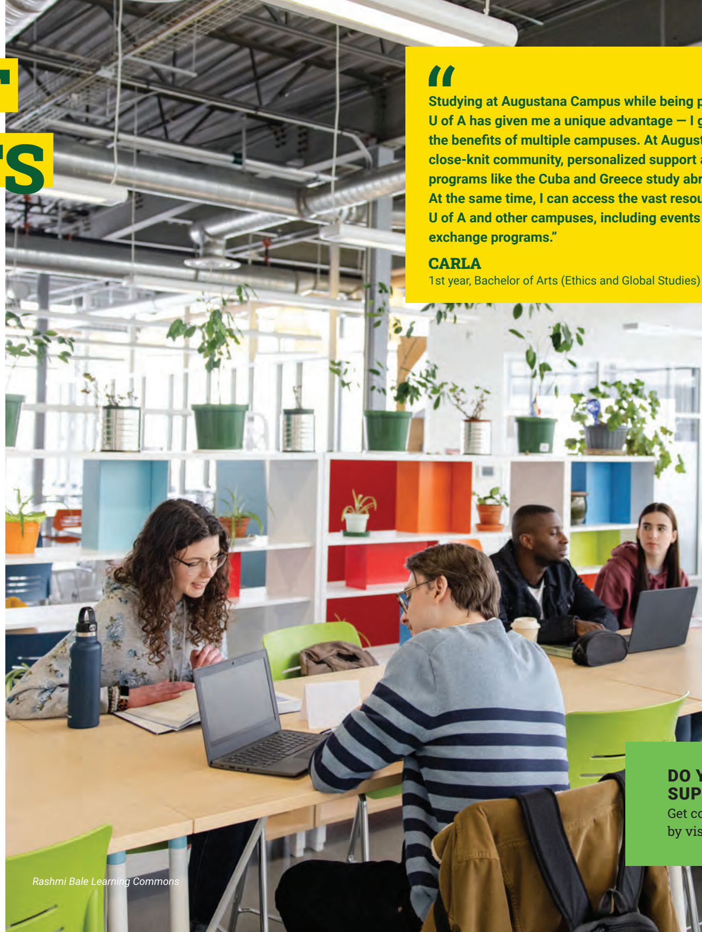
Rashmi Bale Learning Commons

Get connected before you arrive on campus by visiting uab.ca/augpass