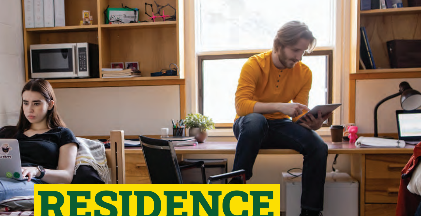
Studying in an Augustana dorm room.